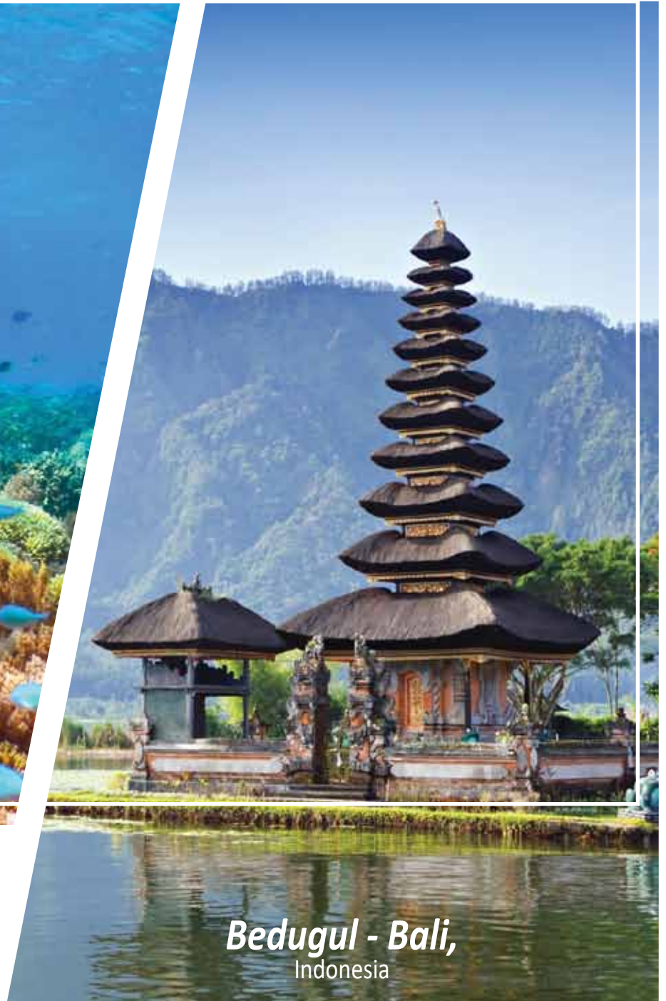
Bedugul - Bali, Indonesia