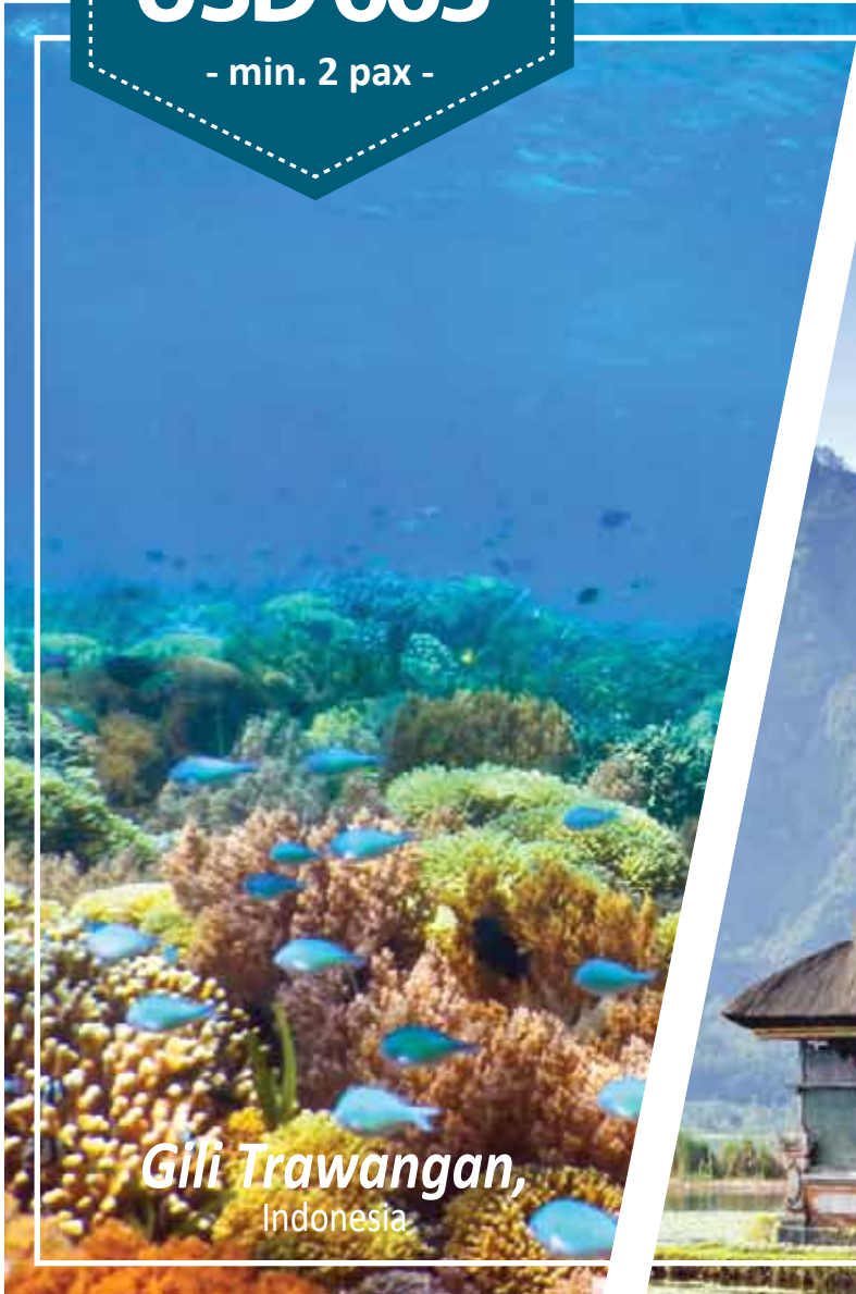
Gili Trawangan, Indonesia